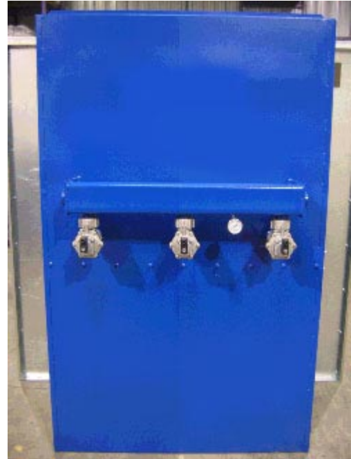
EBM-6 REAR VIEW