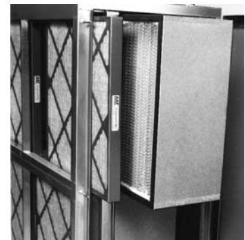
Two-inch AAF AmAir® pleated filters are shown installed in the prefilter track on the upstream end of the housing in front of AstroCel® HCX final filters.

Type S housings are available with a 2" or 4" wide prefilter track. Blank off panels are provided to prevent prefilter bypass. Prefilters are accessed through the final filter access door.