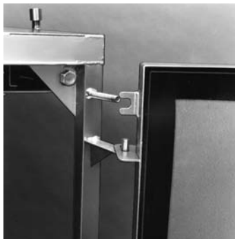
AstroSeal Type S housing with access door open shows how the door rests on the pin hinge. The locking bolt and large gasket on the inside of the door are also shown.

14 gauge steel, continuously seal welded for up to 20" positive or negative pressure. Galvanized or 304 Stainless Steel.